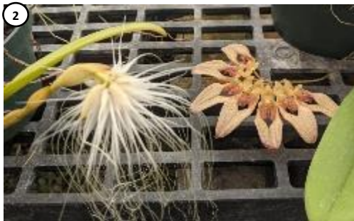
Grown Al Pickrel. 1. Trichoglottis brachiata 2. Bulbophyllums