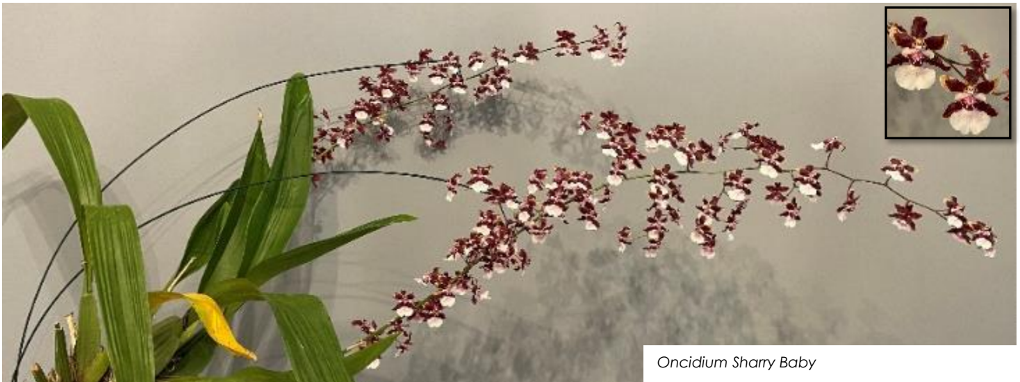
Oncidium Sharry Baby