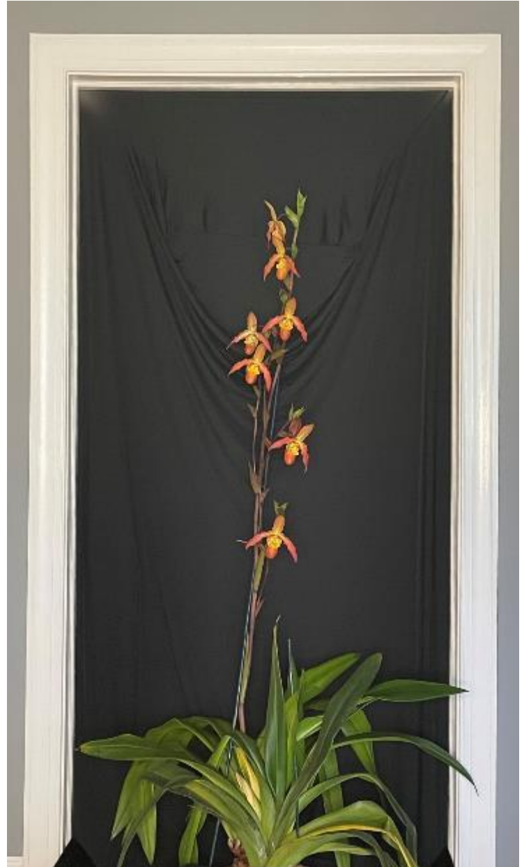
Phragmipedium Bel Royal 'Charles' Grown by Jason Gebbia This is a 4N plant that Jason grows under lights. For reference it is sitting in front of a standard doorway. The spike currently is almost 5 feet tall and still going.