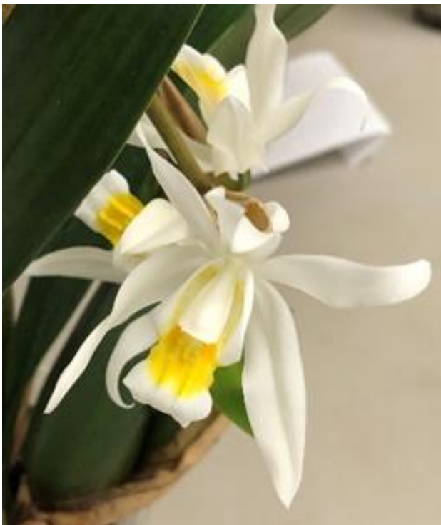
Grown by Suzette Agans Coelogyne sanderiana