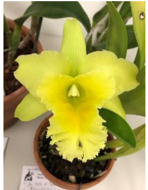
Grown by Marc Levensen Blc. Ports of Paradise 'Emerald Isles' FCC/AOS

Show Table Chair: Organize the monthly show table including, maintaining supplies, selecting judges, and presenting results.