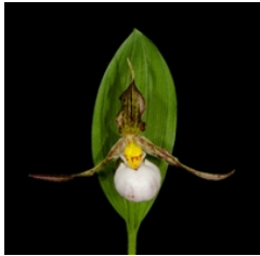
Cypripedium candidum 'Mt. Cuba' HCC/AOS