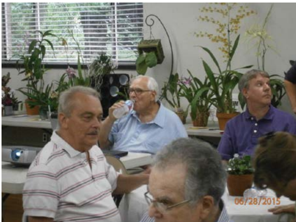
Members socialize after dining and before the auction starts at the 2015 picnic.

Come join the fun as we wind up our 2015-2016 year with the traditional annual picnic and regular meeting on Sunday afternoon, June 26, from 3:00 to 7:00 p.m. (see sign-up sheet and driving directions, page 3). The venue this year will be the same as before, at the North Chevy Chase Christian Church, 8814 Kensington Parkway, in Chevy Chase, MD. As always, the picnic/June meeting will feature an orchid plant auction in lieu of a speaker. Bring a dish to share for 6-8 people to go with the freshly grilled burgers and other meats supplied by NCOS.